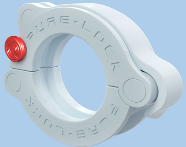
Sizes: 1/2" & 3/4" Mini T/C, 1.0", 1.5" & 2.0"

Pure-Lock is fully compatible with all makes of polymer and stainless steel sanitary clamp connectors and can safely be used with all high purity and sterile media transfer and sampling systems during the connection of tubing, hoses, filters and media bag assemblies.